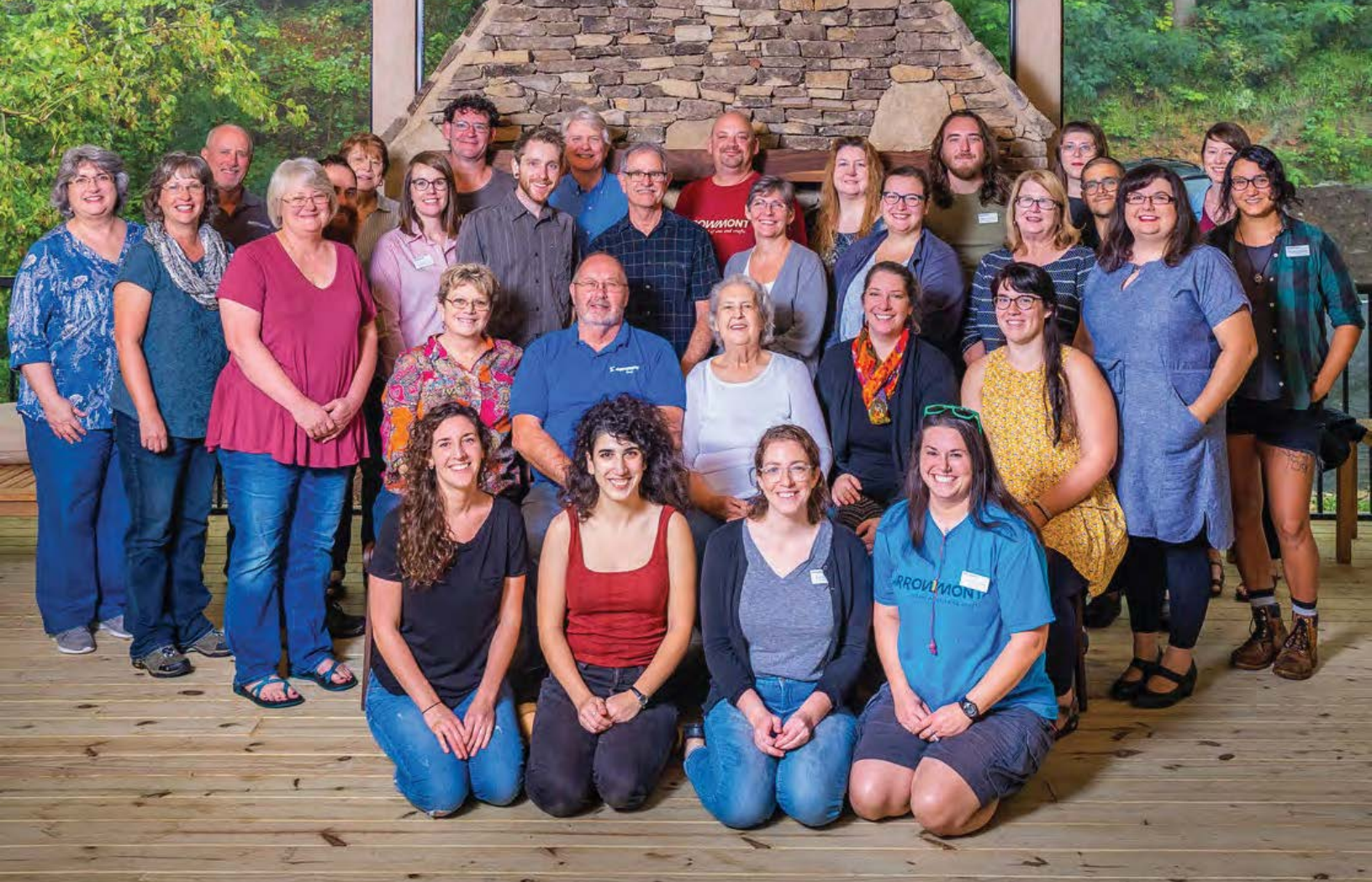
Arrowmont Staff and Residents